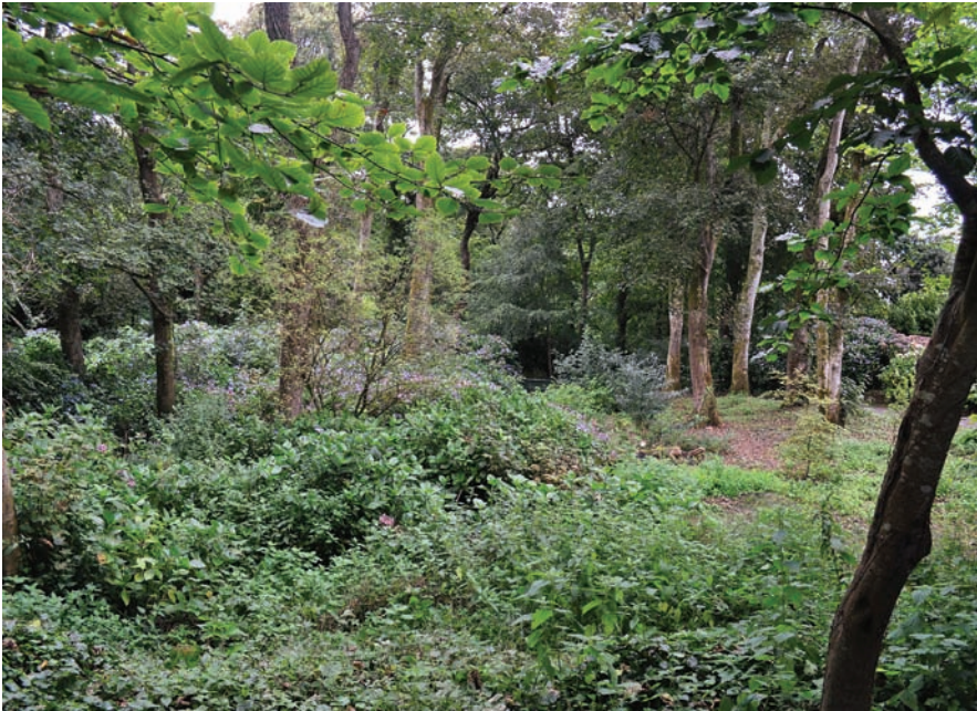
The beautiful woodlands of Tregenna

Tregenna Castle in St Ives has many unique features, not least its position at the top of the town with beautiful views across the sea to the horizon - which makes for a lovely place to visit. It is nestled in a magnificent 72 acre estate, with a beautiful woodland walk and nature trail encompassing the borders of its grounds, encouraging exploration and adventure for both guests and local residents!